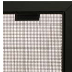
Safety Screen Barrier