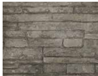
Ledgestone Brick Panels