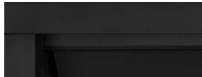
Classic black surround