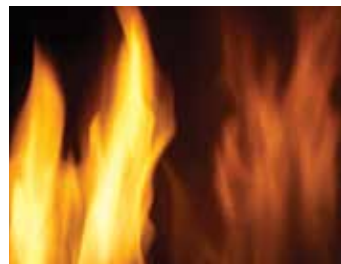
MIRRO-FLAME™ Porcelain Reflective Radiant Panels